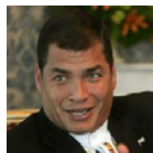
Rafael Correa President Ecuador