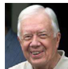
Jimmy Carter Former US President