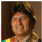
Evo Morales President Bolivia