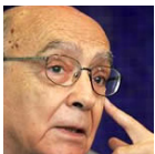
José de Sousa Saramago Nobel Literature Prize Laureate