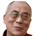
Dalai Lama Nobel Peace Prize Laureate