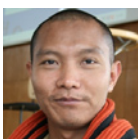
Ashin Sopaka creator of the Movements for Peace and Freedom in Burma