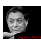
Zubin Mehta Conductor