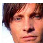
Viggo Mortensen Cinema-Theatre Actor