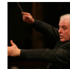
Daniel Barenboim Conductor