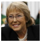
Michelle Bachelet President Chile