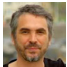
Alfonso Cuarón Orozco Filmmaker "Y tu Mama Tambien" ...