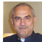
José Manuel Ramos- Horta East Timor's second President Nobel Peace Prize Laureate