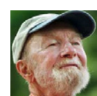
Pete Seeger folk singer political activist