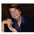
Dr. Helen Caldicott Australian physician, Founder of several antinuclear associations