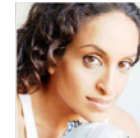
Noa-Achinoam Nini Singer