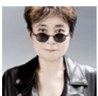
Yoko Ono Artist and Musician