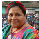
Rigoberta Menchú Nobel Peace Prize Laureate