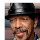
Ornette Coleman Musician Saxophonist and Composer