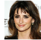
Penelope Cruz Actress