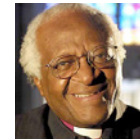
Desmond Tutu Nobel Peace Prize Laureate