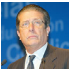
Federico Mayor Zaragoza Director-General of UNESCO for 12 years.