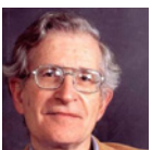
Noam Chomsky MIT Professor Political Analyst