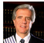
Tabare Vazquez President Uruguay