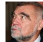
Stjepan Mesic President of the Croatian Republic