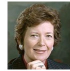
Mary Robinson former President of Ireland, former United Nations High Commissioner for Human Rights